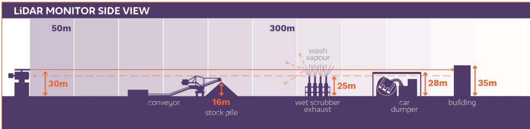
FIGURE 2 LiDAR only operates at the level it has been set. The return signal only monitors either elevated sources or plumes that have reached the scan height