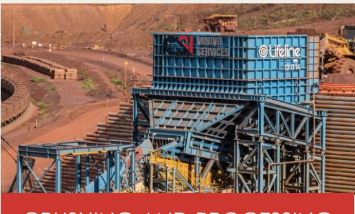
CRUSHING AND PROCESSING