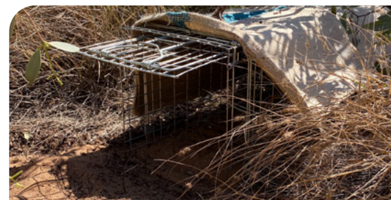
FERAL ANIMAL TRAP

Similar to fox abatement, the most effective control techniques used for feral cats include trapping and baiting euthanasia.