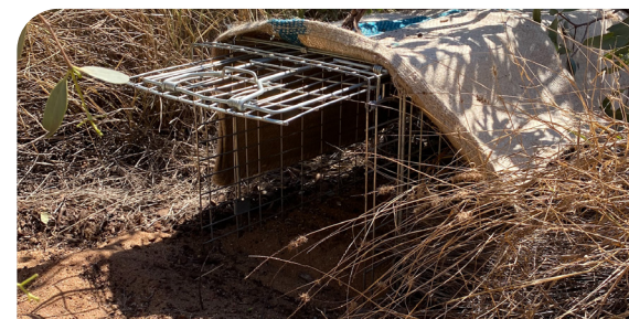
FERAL ANIMAL TRAP

Similar to fox abatement, the most effective control techniques used for feral cats include trapping and baiting euthanasia.